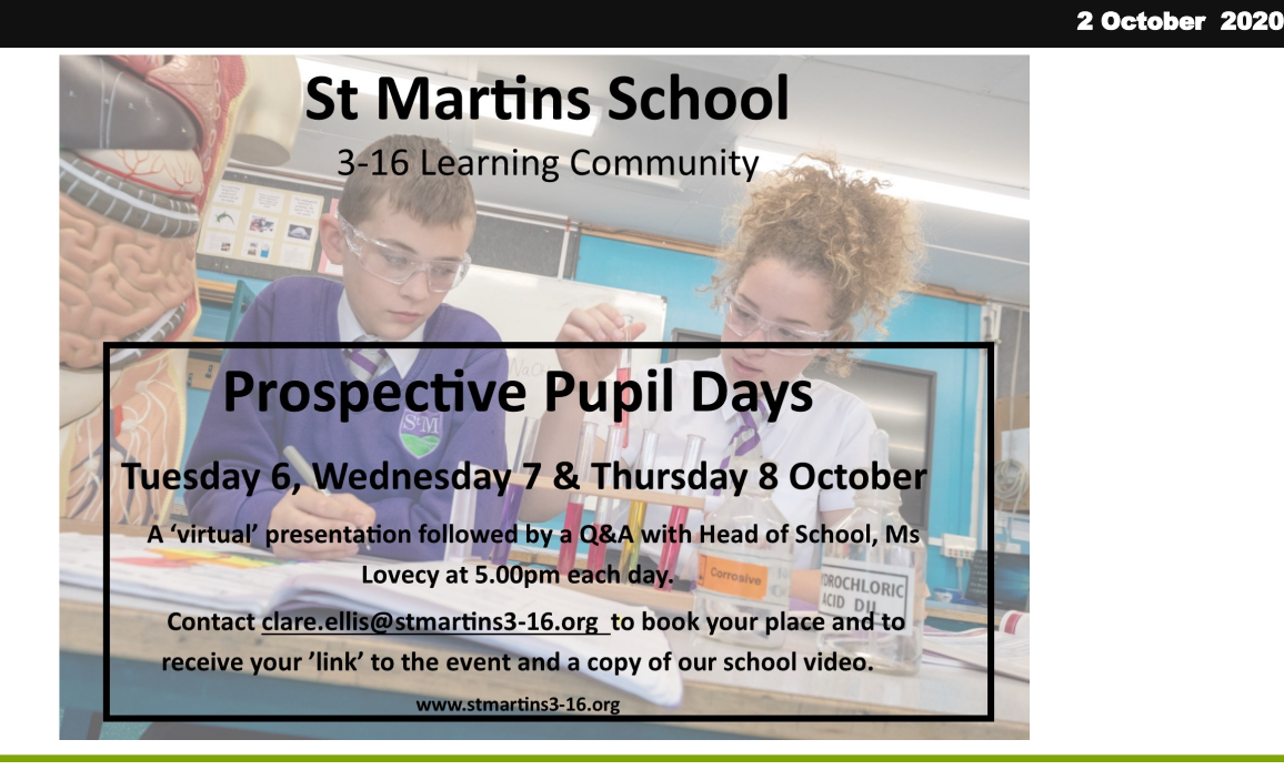
Corona virus—planning for all eventualities