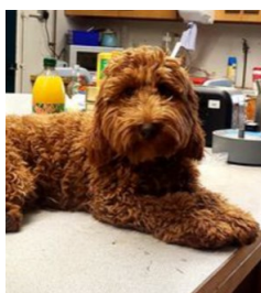
Mr Wilko—school therapy dog