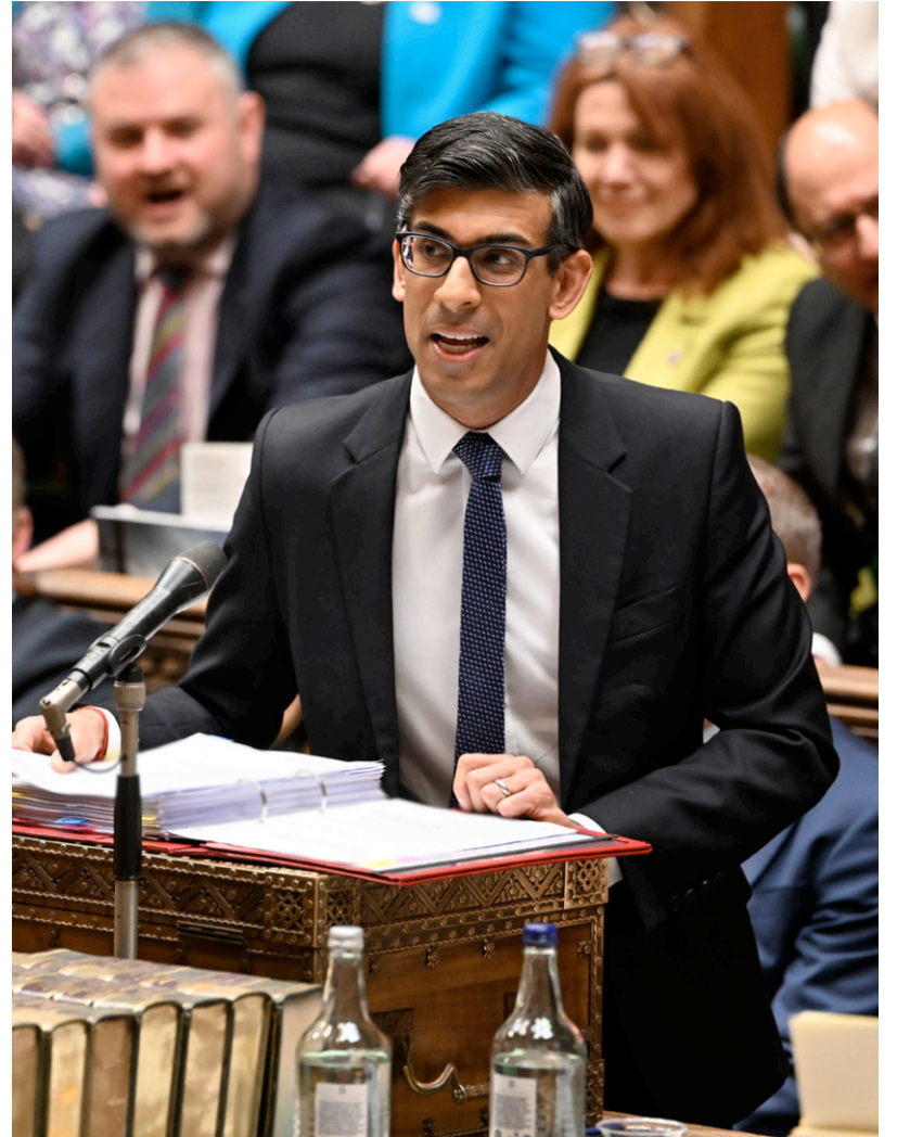
Prime Minister Rishi Sunak in parliament